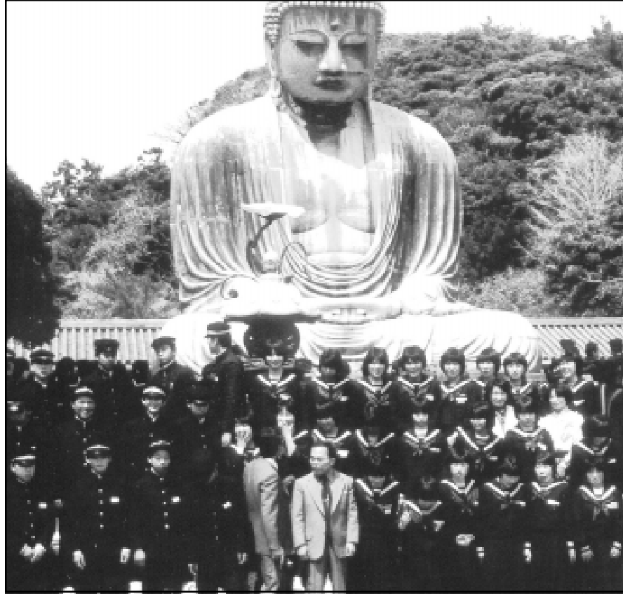
Plate 1. The great Buddha of Kamakura. For thousands of years people have sought the sages and gurus of the East for spiritual enlightenment. Some of the answers may be in our genes.